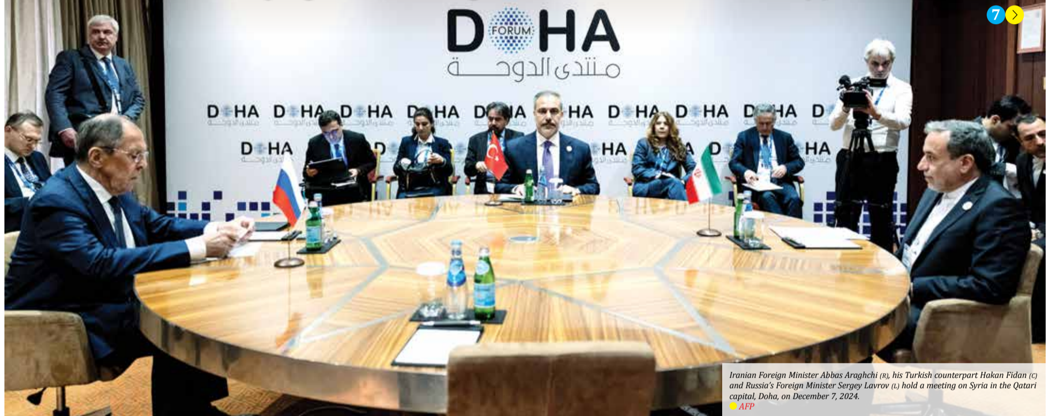
Iranian Foreign Minister Abbas Araghchi (R), his Turkish counterpart Hakan Fidan (C) and Russia's Foreign Minister Sergey Lavrov (L) hold a meeting on Syria in the Qatari capital, Doha, on December 7, 2024.

Iran, Russia, Turkey agree on dialogue between Damascus, opposition groups