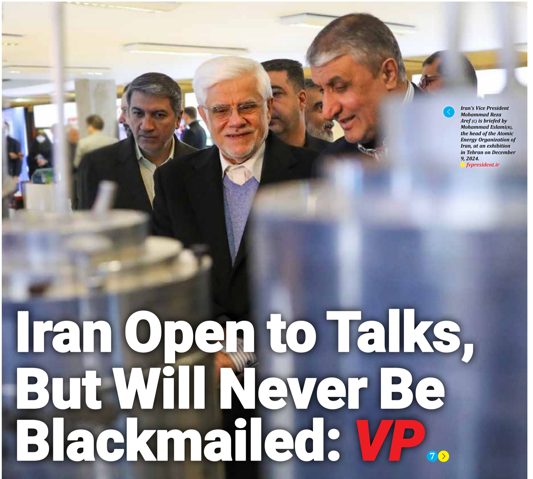
Iran's Vice President Mohammad Reza Aref (c) is briefed by Mohammad Eslami (r), the head of the Atomic Energy Organization of Iran, at an exhibition in Tehran on December 9, 2024.