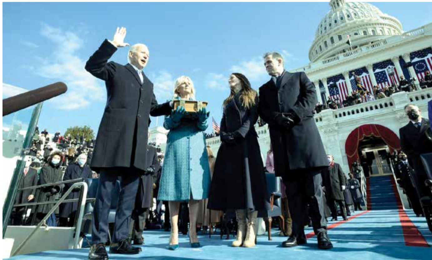
Joe Biden (front-left) is joined by his family, including his son Hunter Biden (front-right), as he takes the oath of office as President of the United States on January 20, 2021.

And, like many other presidents who preceded him and are, of course, destined to follow him, Biden will have a shrine — euphemistically known as a presi-