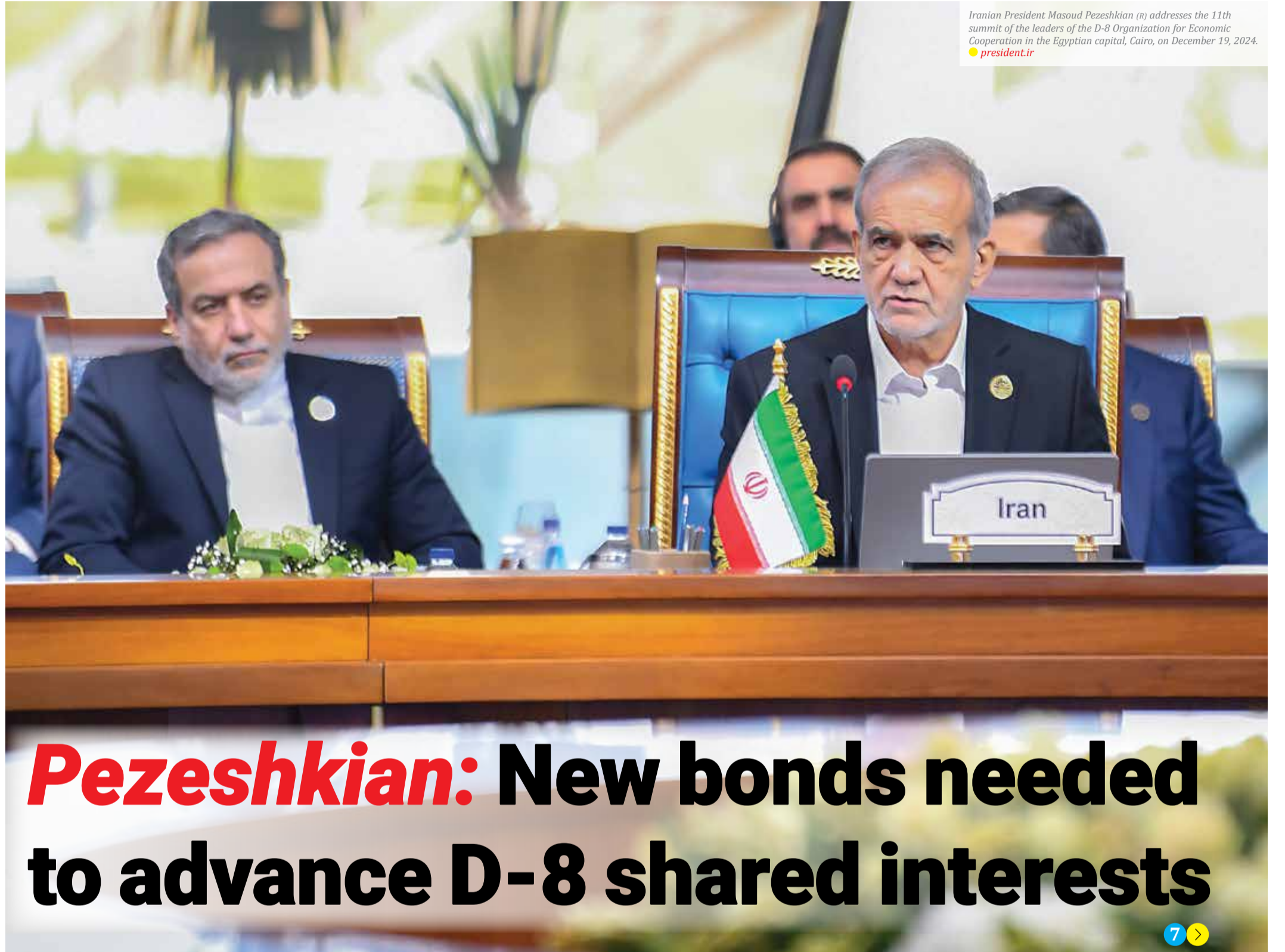
Iranian President Masoud Pezeshkian (R) addresses the 11th summit of the leaders of the D-8 Organization for Economic Cooperation in the Egyptian capital, Cairo, on December 19, 2024.