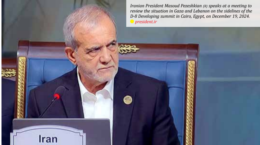
Iranian President Masoud Pezeshkian (R) speaks at a meeting to review the situation in Gaza and Lebanon on the sidelines of the D-8 Developing summit in Cairo, Egypt, on December 19, 2024.

Iranian President Masoud Pezeshkian on Thursday urged the group of D-8 countries to "forge new bonds" to foster development and advance shared interests during a summit in the Egyptian capital Cairo. "The importance of maintaining friendships and forging new bonds through multilateral cooperation among Islamic countries, based on development and the