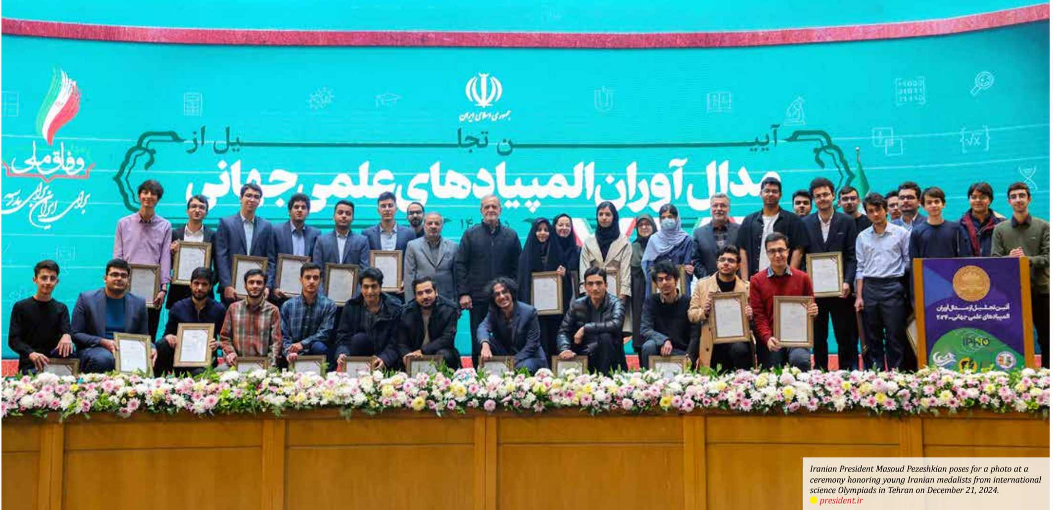
Iranian President Masoud Pezeschkian poses for a photo at a ceremony honoring young Iranian medalists from international science Olympiads in Tehran on December 21, 2024.