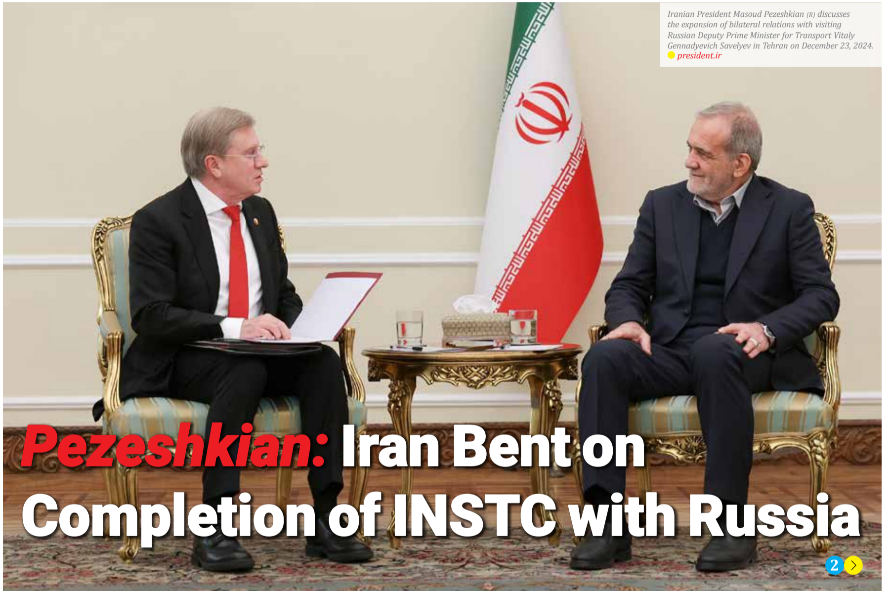
Iranian President Masoud Pezeshkian (R) discusses the expansion of bilateral relations with visiting Russian Deputy Prime Minister for Transport Vitaly Gennadyevich Savelyev in Tehran on December 23, 2024.