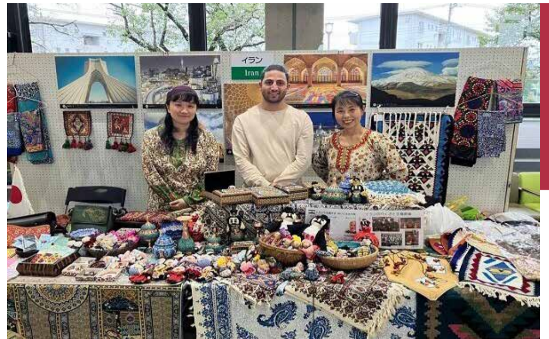
A showcase of exquisite Iranian handicrafts at the AGEO World Fair in Saitama, Japan, 2023

Yes, there are scholarships available for Iranian students to study in Japan. Every year, there is an