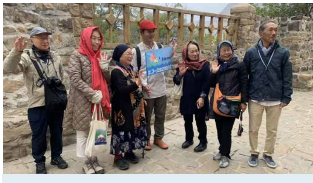
Japanese tourists in Iran

Japan is a volcanic and seismic country, similar to Iran, which hosts a lot of appealing hot springs.