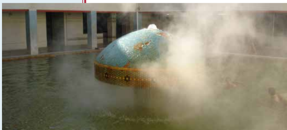
A hot spring in Sarein, Iran

There are some film enthusiasts who are passionate about showcasing Iranian films in Japan, despite the commercial limitations.