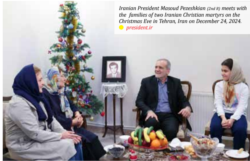
Iranian President Masoud Pezeshkian (2nd R) meets with the families of two Iranian Christian martyrs on the Christmas Eve in Tehran, Iran on December 24, 2024.

President meets with families of Iranian Christian martyrs