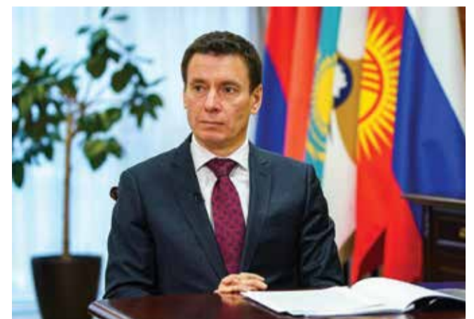
Andrei Slepnev, the Minister of Trade for the Eurasian Economic Union

Slepnev believes that the EAEU actively forms a network of economic partnerships with friendly countries. The Economic Partnership Agreement with the United Arab Emirates is a significant milestone, given the UAE's role as a global hub in