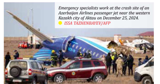
Emergency specialists work at the crash site of an Azerbaijan Airlines passenger jet near the western Kazakh city of Aktau on December 25, 2024.

According to Kazakhstani officials, those aboard the