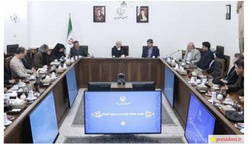
gaps and restore hope within society. He underscored the urgent need for a robust plan to attract an estimated $150 billion in investments, which is crucial for achieving an eight percent growth rate, sustainable employment, poverty reduction, and stabilizing inflation.

confrontational behavior and labeling of well-meaning individuals and experts in the country. He noted that while the filtering of social media networks may not have initially appeared significant, it has become a contentious issue, and the government is committed to addressing this matter through national consensus. He reiterated that the government is focused on ensuring the sustainability of its actions and achievements, stating, "Instead of temporary solutions and 'band-aid' fixes, we are seeking fundamental remedies." Aref recognized the discourse of national unity as a historic opportunity for the administration to correct past mistakes and achieve sustainable economic development. In his concluding remarks, Aref called on social scientists to provide actionable solutions to bridge generational