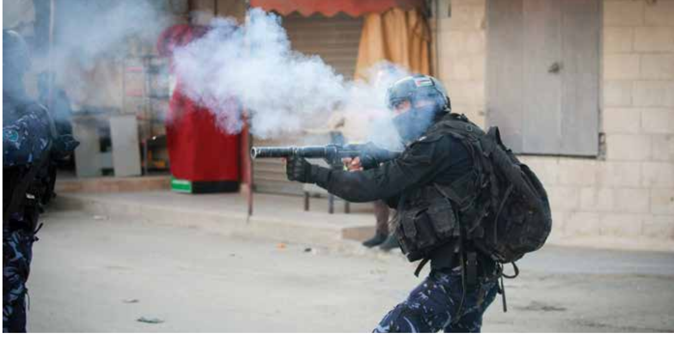
Palestinian Authority security officers launch smoke grenades during clashes with Palestinians in the West Bank city of Jenin on December 16, 2024.

The West Bank offers a stark picture of the PA's complicity. Its security forces regularly suppress protests, detain activists, and silence dissent, often violently. During Israel's ongoing genocide in Gaza, the PA's repression escalated further. According to the Committee for Political Prisoners, the PA had killed five Palestinians and arrested dozens more by the end of 2023. Just three weeks ago, the PA launched a security campaign to uproot the resistance forces in Jenin. Dubbed "The Protection of the Homeland," the campaign aims to "[restore] the camp from the grip of outlaws who disrupted the citizen's daily life and deprived them of their right to access public services freely and securely". Similarly, in 2008, the PA enacted a count-