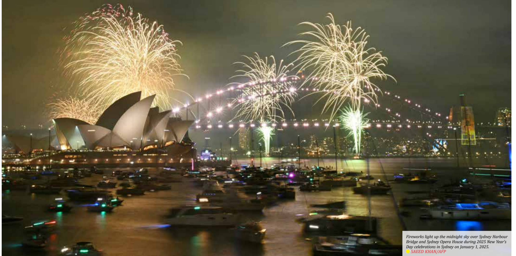
Fireworks light up the midnight sky over Sydney Harbour Bridge and Sydney Opera House during 2025 New Year's Day celebrations in Sydney on January 1, 2025.

Pezeshkian hopes war, genocide to end in 2025 7 >