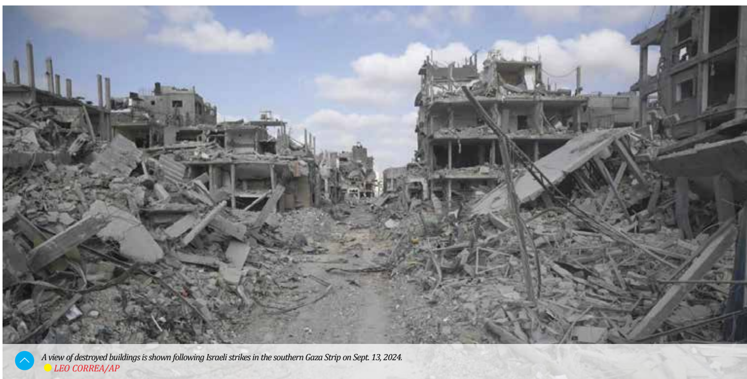
A view of destroyed buildings is shown following Israeli strikes in the southern Gaza Strip on Sept. 13, 2024.

ous inter-state conflicts more than ever before. This is a situation that the world has witnessed in several regions this year.