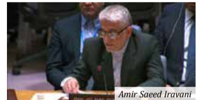
Amir Saeed Iravani

The ambassador described it as both deeply troubling and highly ironic that the US and Britain, instead of upholding their responsibilities as permanent members of the Security Council to maintain international peace and security, persist in providing political cover and military support for Israel's reckless actions and violations while fabricating baseless accusations against Iran. "This blatant complicity has embold-