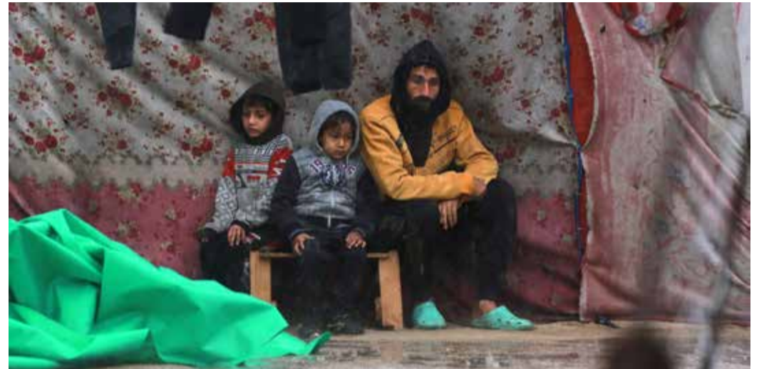
Palestinians take shelter from the rain at a makeshift camp housing displaced Palestinians in Khan Yunis, in the southern Gaza Strip on December 31, 2024, amid the continuing Israel's strikes.

"Let these celebrations be a global occasion to continue and escalate all forms of demonstrations and marches" against Israel's aggression, a statement said.