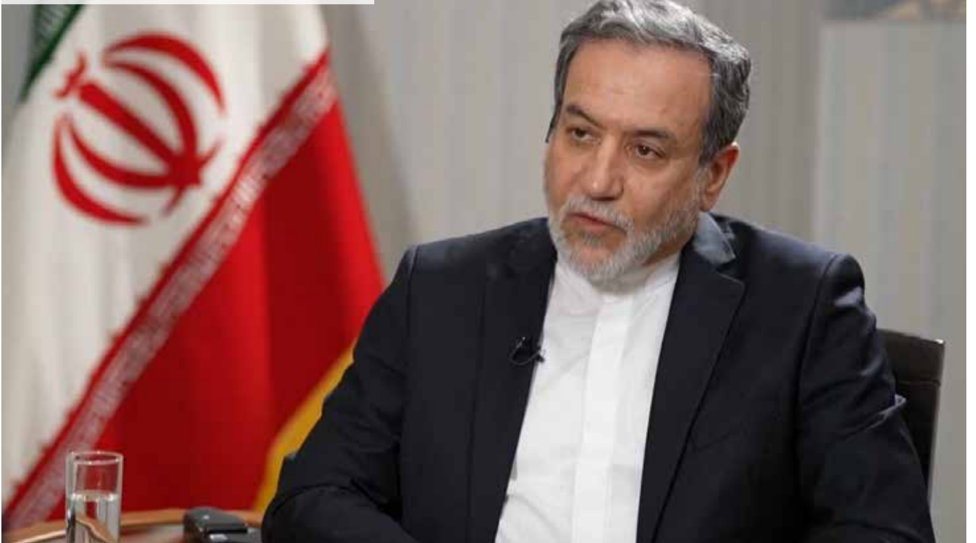
The photo grabbed from a video shows Iran's Foreign Minister Abbas Araghchi speaking during an interview with China's CCTV.

tions, Tehran initiated a set of retaliatory nuclear steps, including by activating more advanced centrifuges. The country has been stepping up the measures in response to the other parties' continued refusal to uphold their obligations. Earlier this year, the European