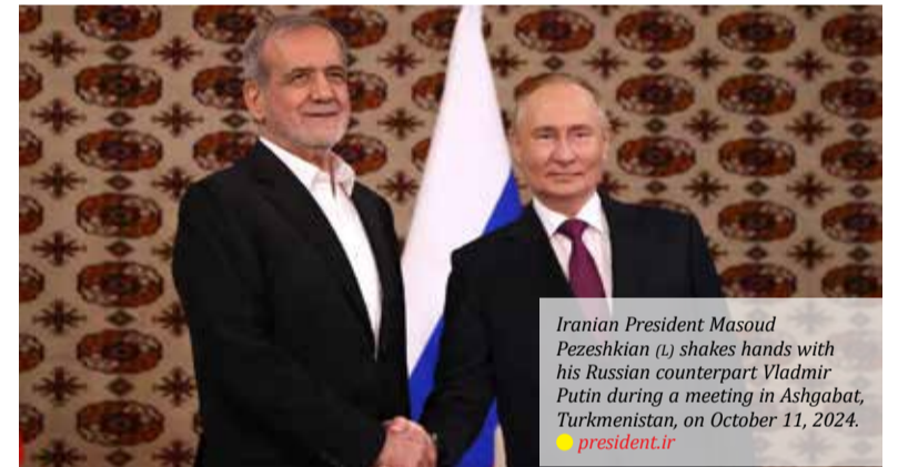
Iranian President Masoud Pezeshkian (L) shakes hands with his Russian counterpart Vladimir Putin during a meeting in Ashgabat, Turkmenistan, on October 11, 2024.