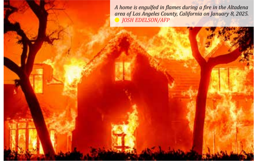
A home is engulfed in flames during a fire in the Altadena area of Los Angeles County, California on January 8, 2025.