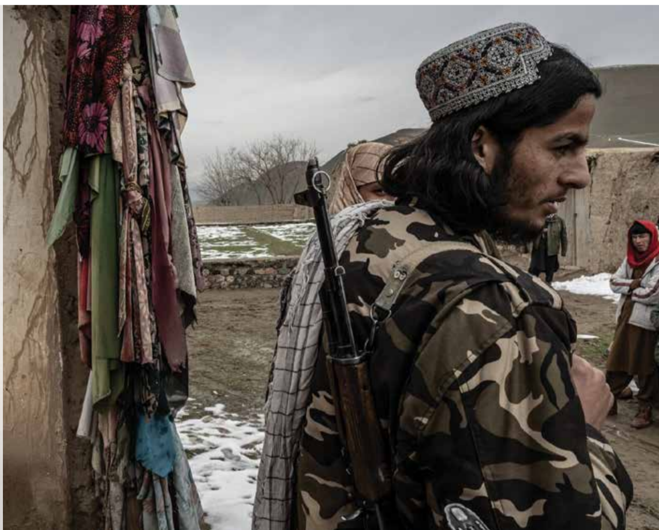
Taliban fighter stands guard in Dana, Kunduz, two years ago near a home adorned with colorful strips of cloth that are used by residents to denote where blood has been spilled. The building was the site of a massacre of young men by militia gunmen backed by the US and Afghan governments.