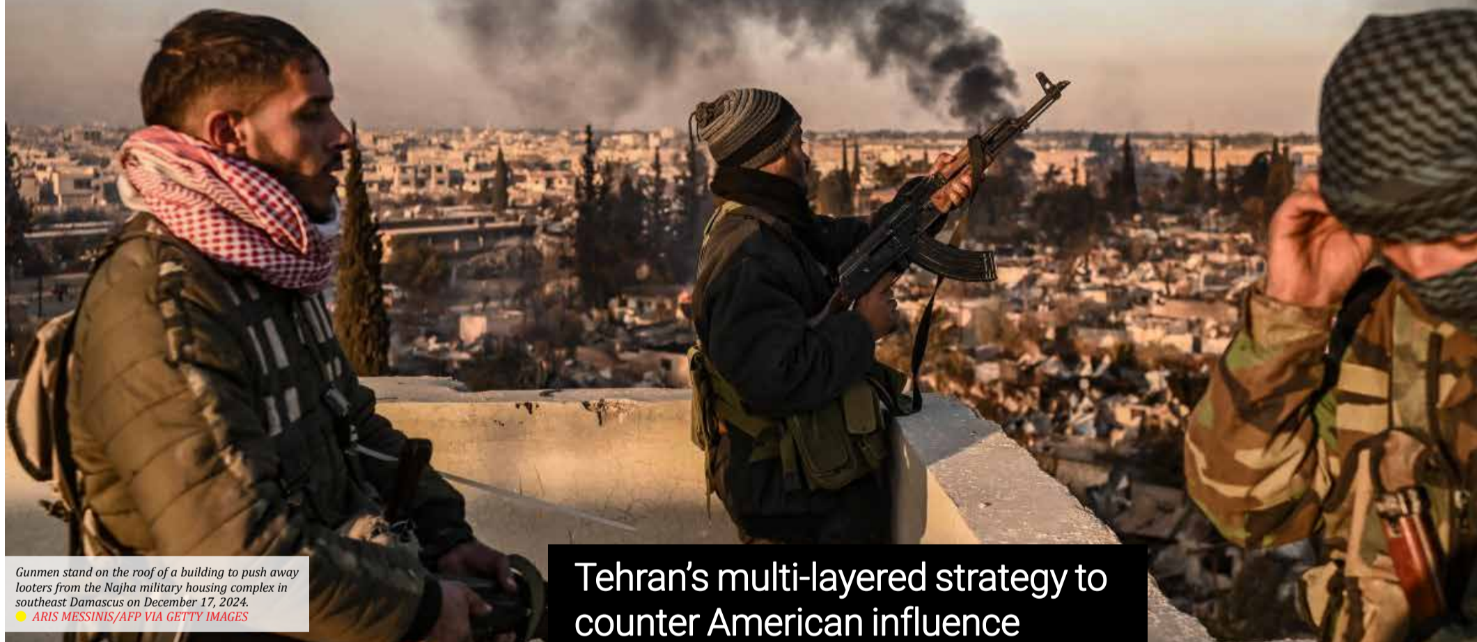
Gunmen stand on the roof of a building to push away looters from the Najha military housing complex in southeast Damascus on December 17, 2024.