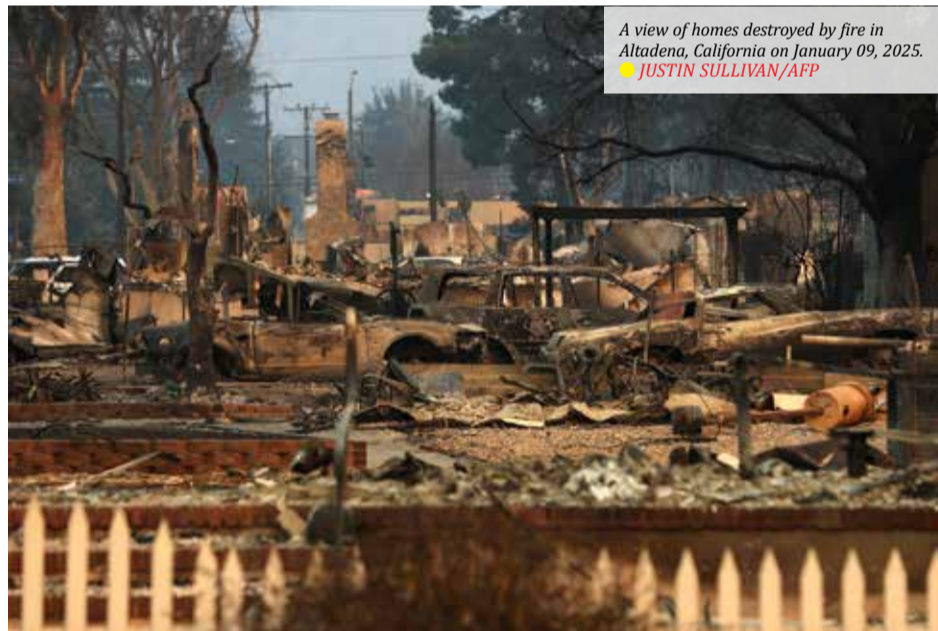
A view of homes destroyed by fire in Altadena, California on January 09, 2025.