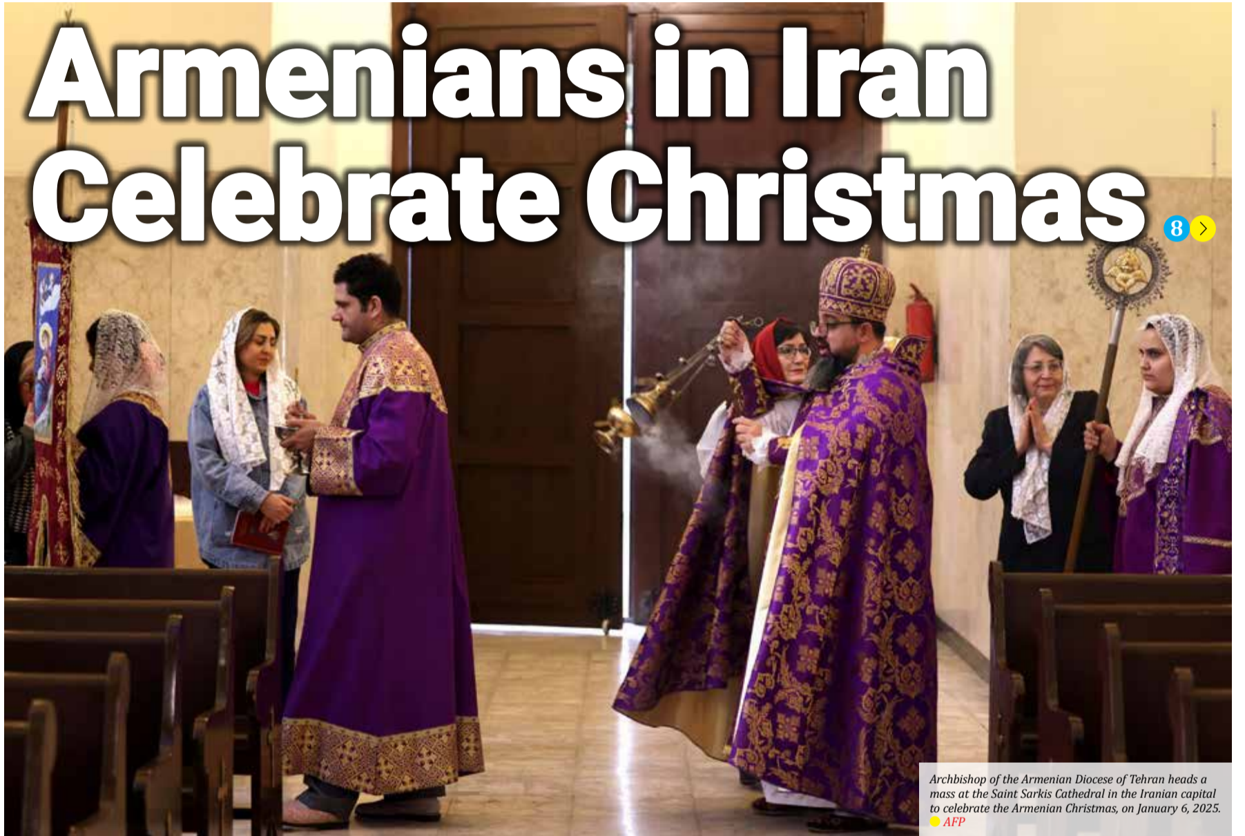
Archbishop of the Armenian Diocese of Tehran heads a mass at the Saint Sarkis Cathedral in the Iranian capital to celebrate the Armenian Christmas, on January 6, 2025.