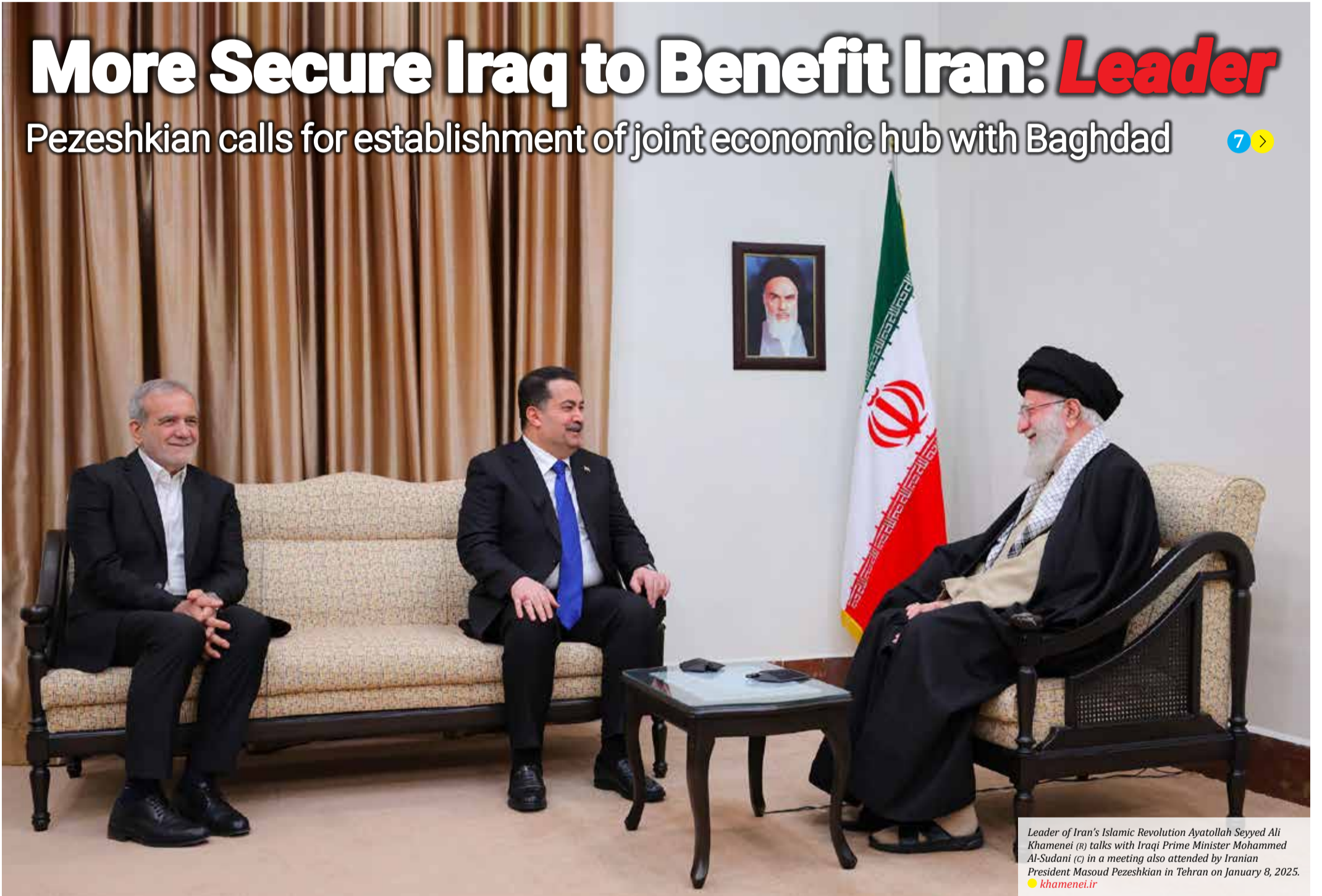
Leader of Iran's Islamic Revolution Ayatollah Seyyed Ali Khamenei (R) talks with Iraqi Prime Minister Mohammed Al-Sudani (C) in a meeting also attended by Iranian President Masoud Pezeshkian in Tehran on January 8, 2025.

Pezeshkian calls for establishment of joint economic hub with Baghdad 7 >