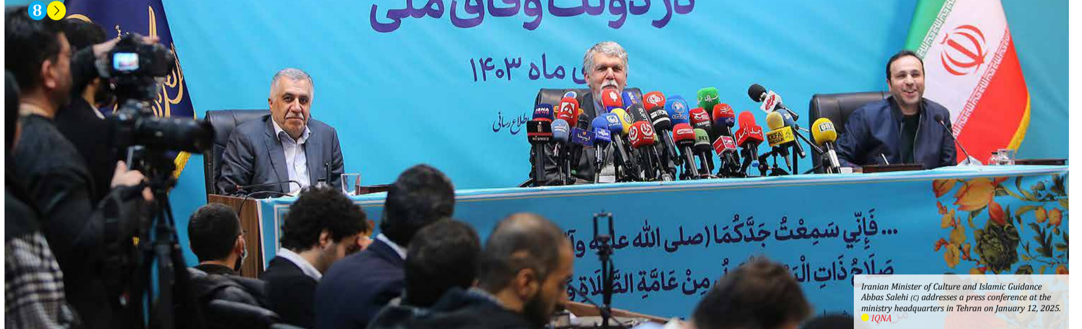
Iranian Minister of Culture and Islamic Guidance Abbas Salehi (c) addresses a press conference at the ministry headquarters in Tehran on January 12, 2025.