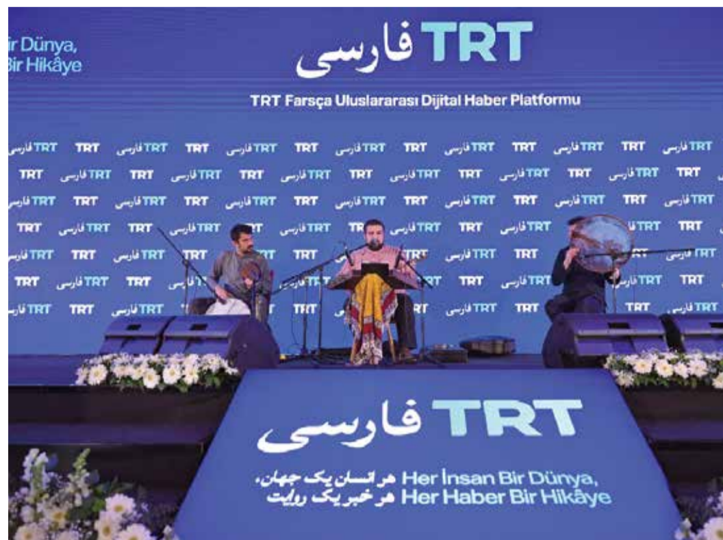
Musicians play a tune in the launch ceremony of Turkey's new Farsi-language channel, TRT Farsi, aired on December 17, 2024.

Although more details about the channel's activities have not yet been announced, from the perspective of political-media analysis, some experts say that the network's activity may be aimed at influencing Iranian Azeri speakers — specifically those who consider themselves Turkish speakers. Others, however, dismiss this notion and believe that the Turkish state television, through the launch of a Farsi-language service, can contribute to goals such as boosting tourism in Turkey.