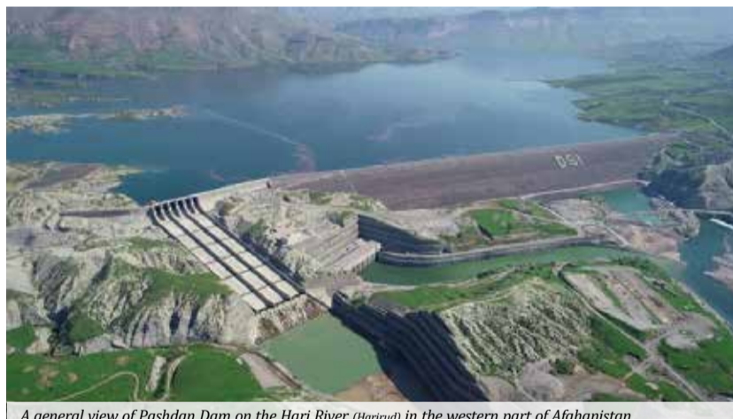
A general view of Pashdan Dam on the Hari River (Harirud) in the western part of Afghanistan

Baghaei said that Iran's Foreign Ministry has expressed its strong protest to the Afghan officials over the disproportionate curtailment of the waters entering Iran or the diversion of the natural course of rivers as the Islamic republic expects the eastern neighbor to take appropriate decisions in this regard. Afghanistan has constructed a new