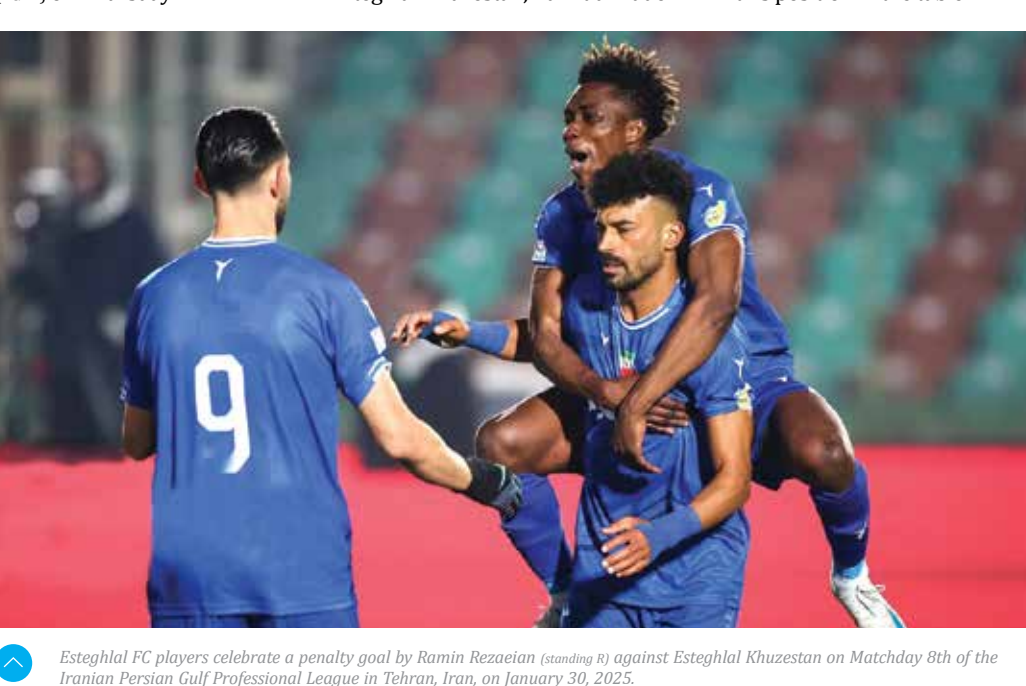
Iranian Persian Gulf Professional League in Tehran, Iran, on January 30, 2025.

However, the table is bound to change as other teams, especially all the top four teams, play their matches from Friday to Sun-