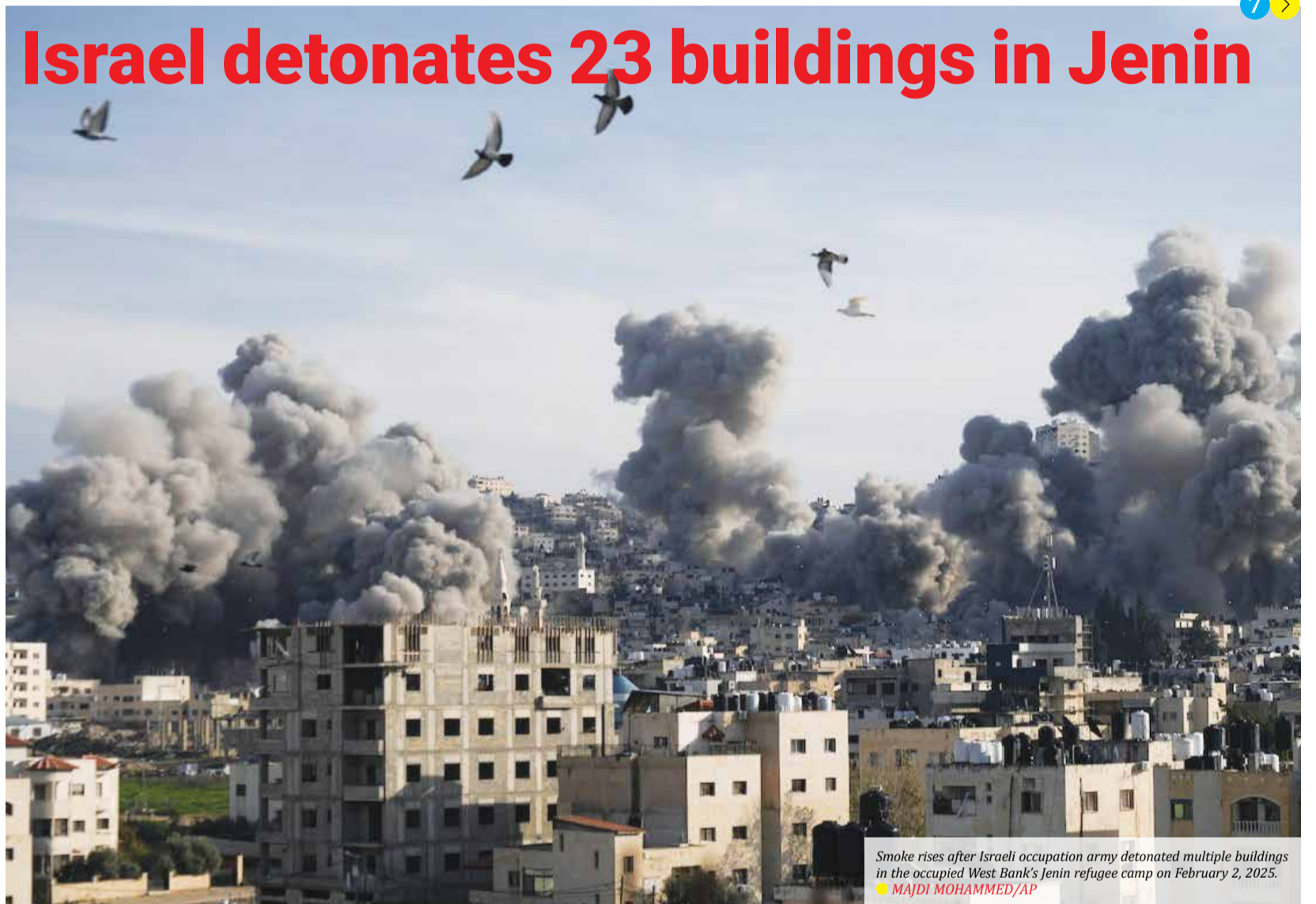
Smoke rises after Israeli occupation army detonated multiple buildings in the occupied West Bank's Jenin refugee camp on February 2, 2025.