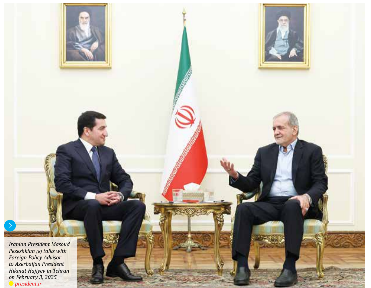
Iranian President Masoud Pezeshkian (R) talks with Foreign Policy Advisor to Azerbaijan President Hikmat Hajiyev in Tehran on February 3, 2025.