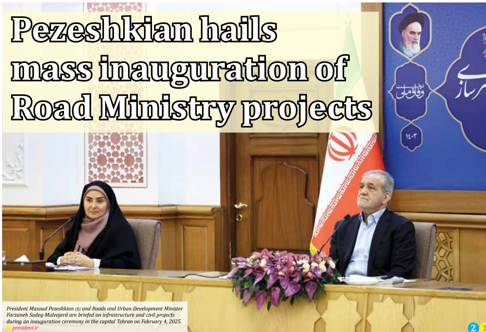
President Masoud Pezeschkian (R) and Roads and Urban Development Minister Farzaneh Sadeq-Malvajerd are briefed on infrastructure and civil projects during an inauguration ceremony in the capital Tehran on February 4, 2025.

Iran welcomes domestic, foreign investment in gas fields