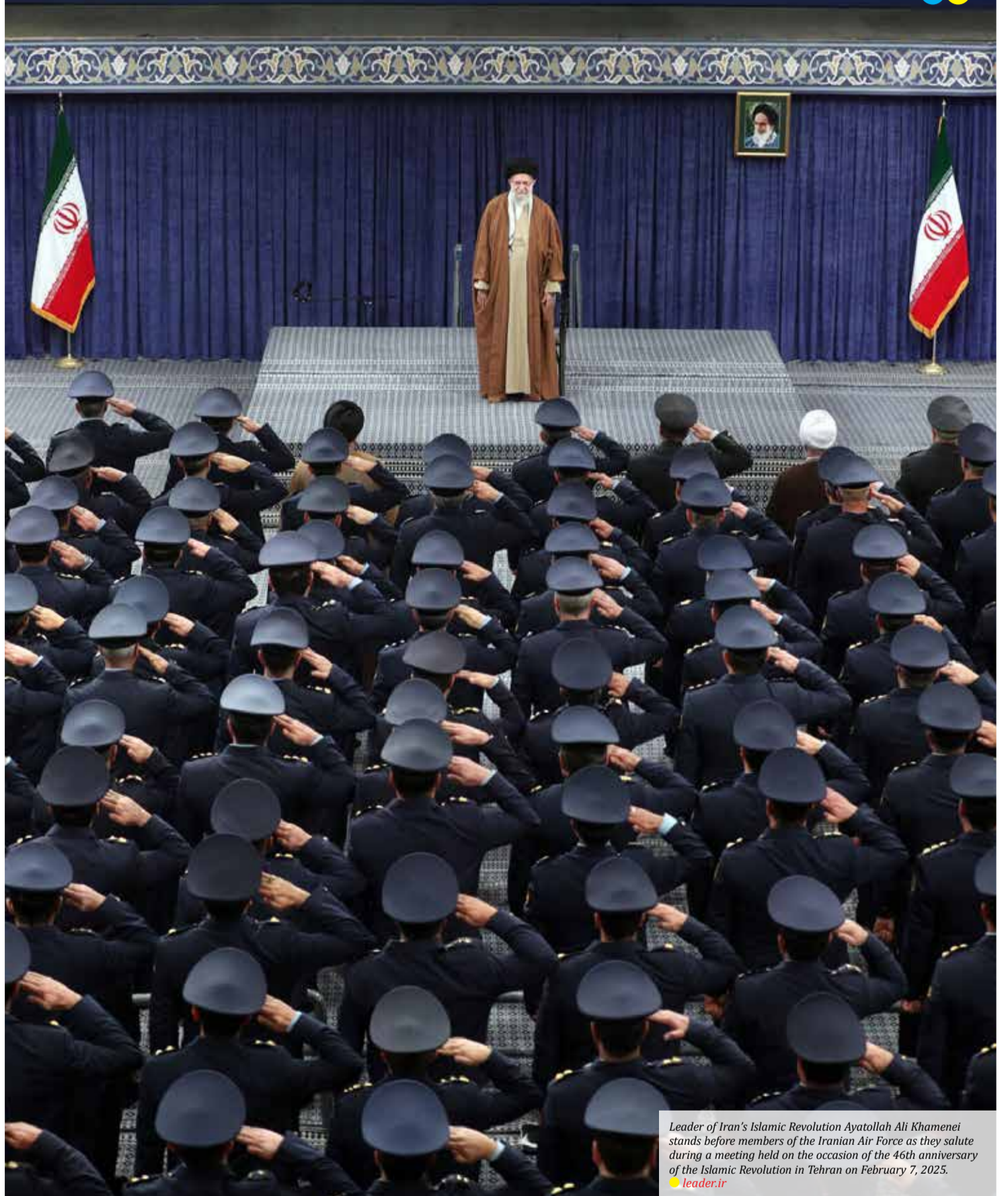
Leader of Iran's Islamic Revolution Ayatollah Ali Khamenei stands before members of the Iranian Air Force as they salute during a meeting held on the occasion of the 46th anniversary of the Islamic Revolution in Tehran on February 7, 2025.