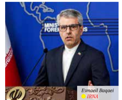
Esmail Baqaei

Iranian Foreign Ministry spokesperson Esmail Baqaei said the United States' decision to sanction the International Criminal Court (ICC) is aimed at granting Israel full impunity for its criminal acts in pursuit of its "colonial erasure" of Palestine. Baqaei made the comments after US President Donald Trump signed an executive order imposing bans on the ICC which has issued arrest warrants for Israeli Prime Minister Benjamin Netanyahu and his former military affairs minister Yoav Gallant for war crimes during the war on Gaza.