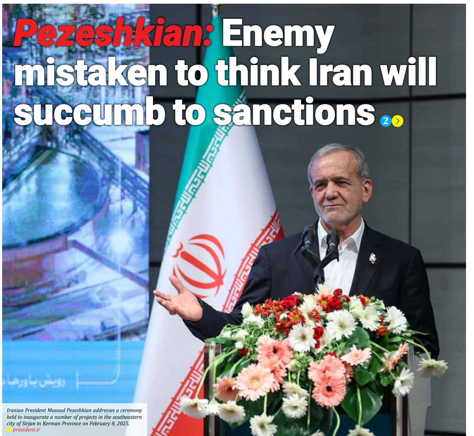
Iranian President Masoud Pezeshkian addresses a ceremony held to inaugurate a number of projects in the southeastern city of Sirjan in Kerman Province on February 8, 2025.