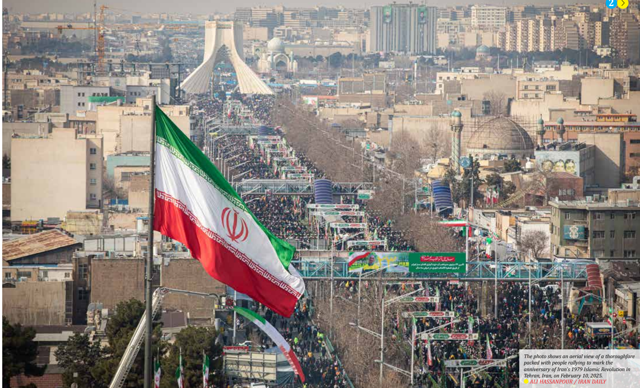
The photo shows an aerial view of a thoroughfare packed with people rallying to mark the anniversary of Iran's 1979 Islamic Revolution in Tehran, Iran, on February 10, 2025.