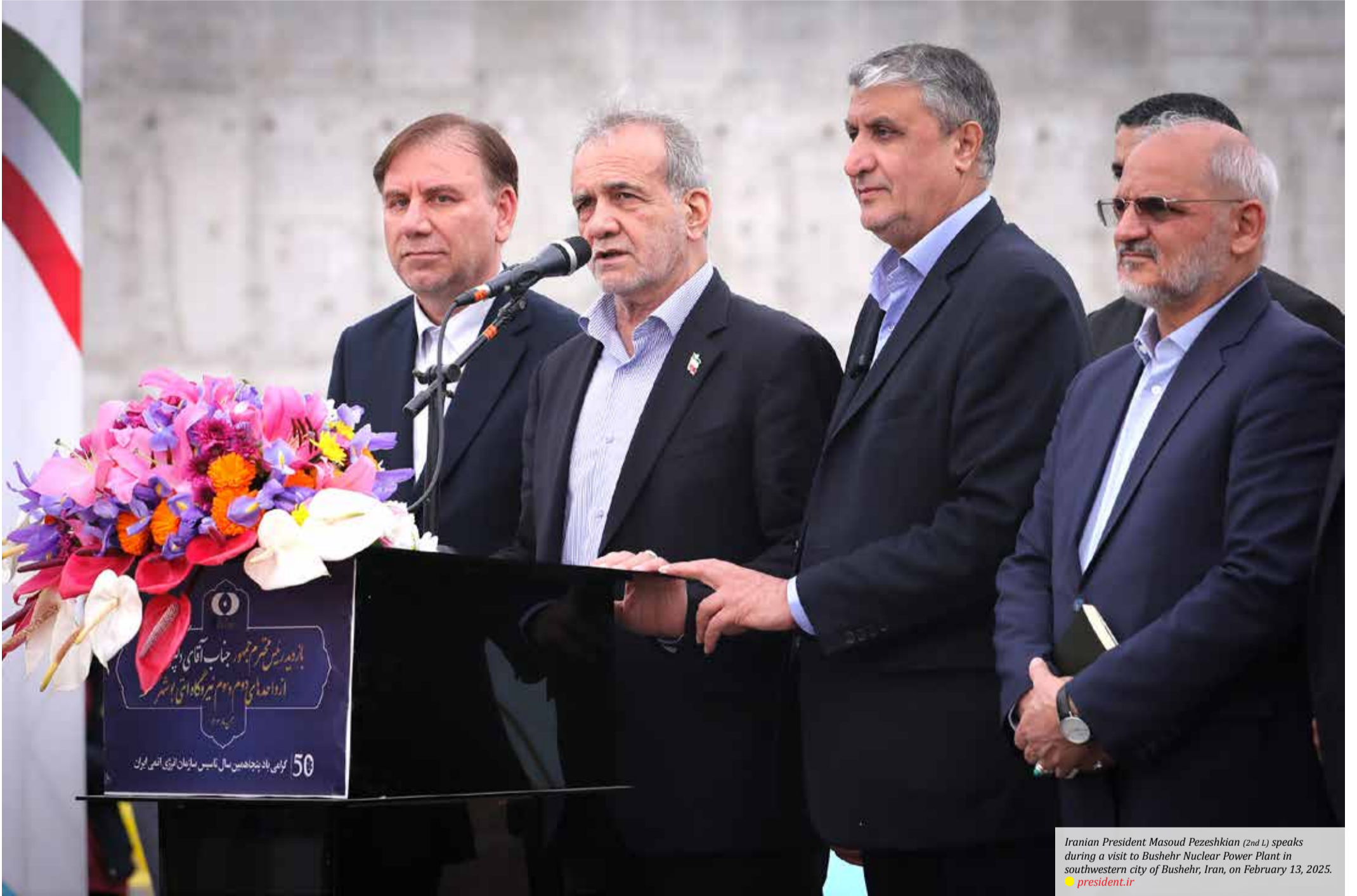
Iranian President Masoud Pezeshkian (2nd L) speaks during a visit to Bushehr Nuclear Power Plant in southwestern city of Bushehr, Iran, on February 13, 2025.