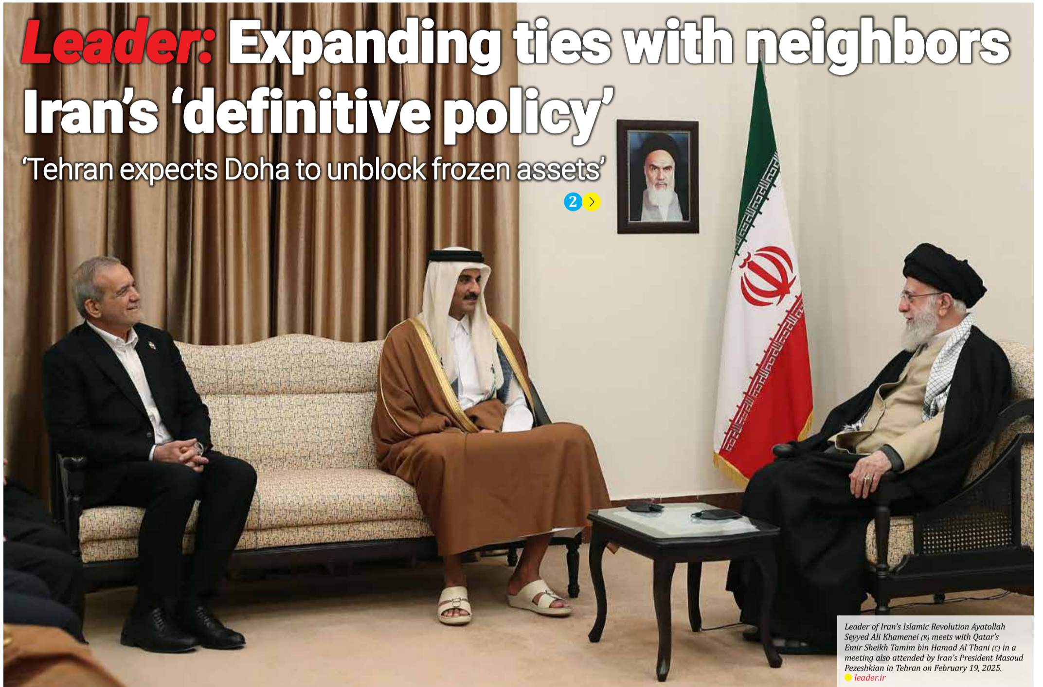
Leader of Iran's Islamic Revolution Ayatollah Seyyed Ali Khamenei (R) meets with Qatar's Emir Sheikh Tamim bin Hamad Al Thani (C) in a meeting also attended by Iran's President Masoud Pezeshkian in Tehran on February 19, 2025.