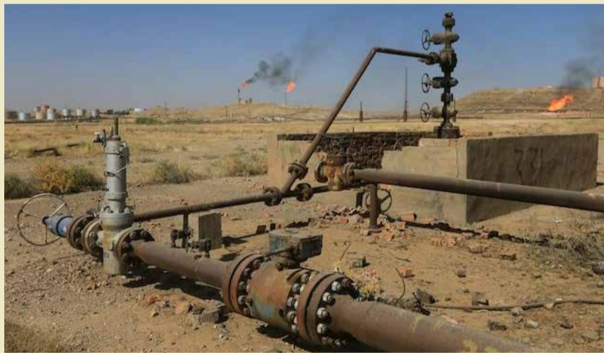
An oil field is seen in Kirkuk, Iraq, October 18, 2017.