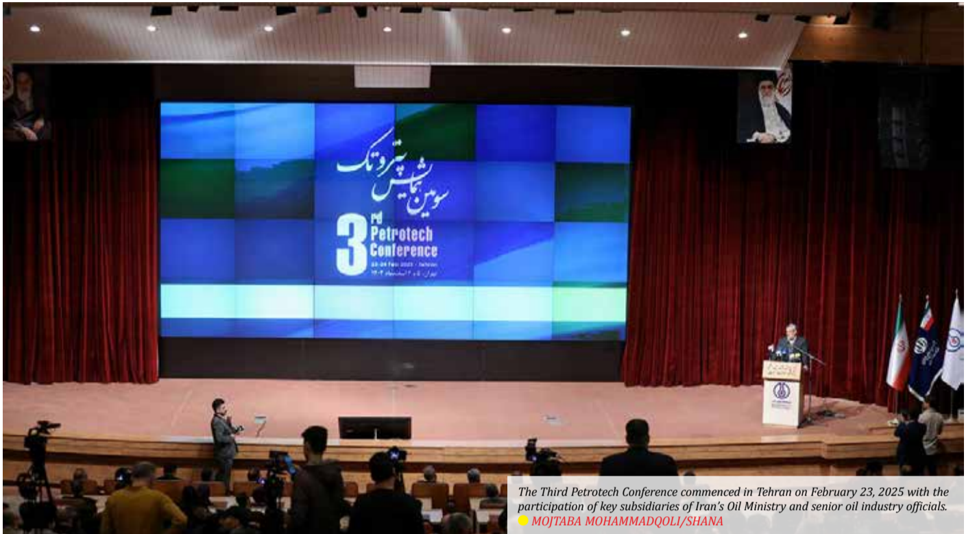
The Third Petrotech Conference commenced in Tehran on February 23, 2025 with the participation of key subsidiaries of Iran's Oil Ministry and senior oil industry officials.

and petrochemical equipment supplier. The contract was finalized between the National Iranian Gas Company, and Petro Tolid Fahm Co. MDEA has extensive application in the gas sweetening process in refining and petrochemical industries, aiming to separate hydrogen sulfide and carbon dioxide to prevent corrosion of gas transmission pipelines and preserve the thermal value of natural gas. The National Iranian Offshore Oil Company also signed two contracts. It first signed a contract with the manufacturing company, Turbin Machine Middle East, for the production and localization of 6 to 9 MW class Solar Taurus 70 turbine turbo generators. Additionally, the National Iranian Offshore Oil Company signed another contract with a knowledge-based company for the design, construction, and commissioning of the Qeshm processing plant's industrial wastewater treatment system for discharge according to environmental standards. The Arvandan Oil and Gas Company also clinched a contract for the provision of a device for measuring sulfur