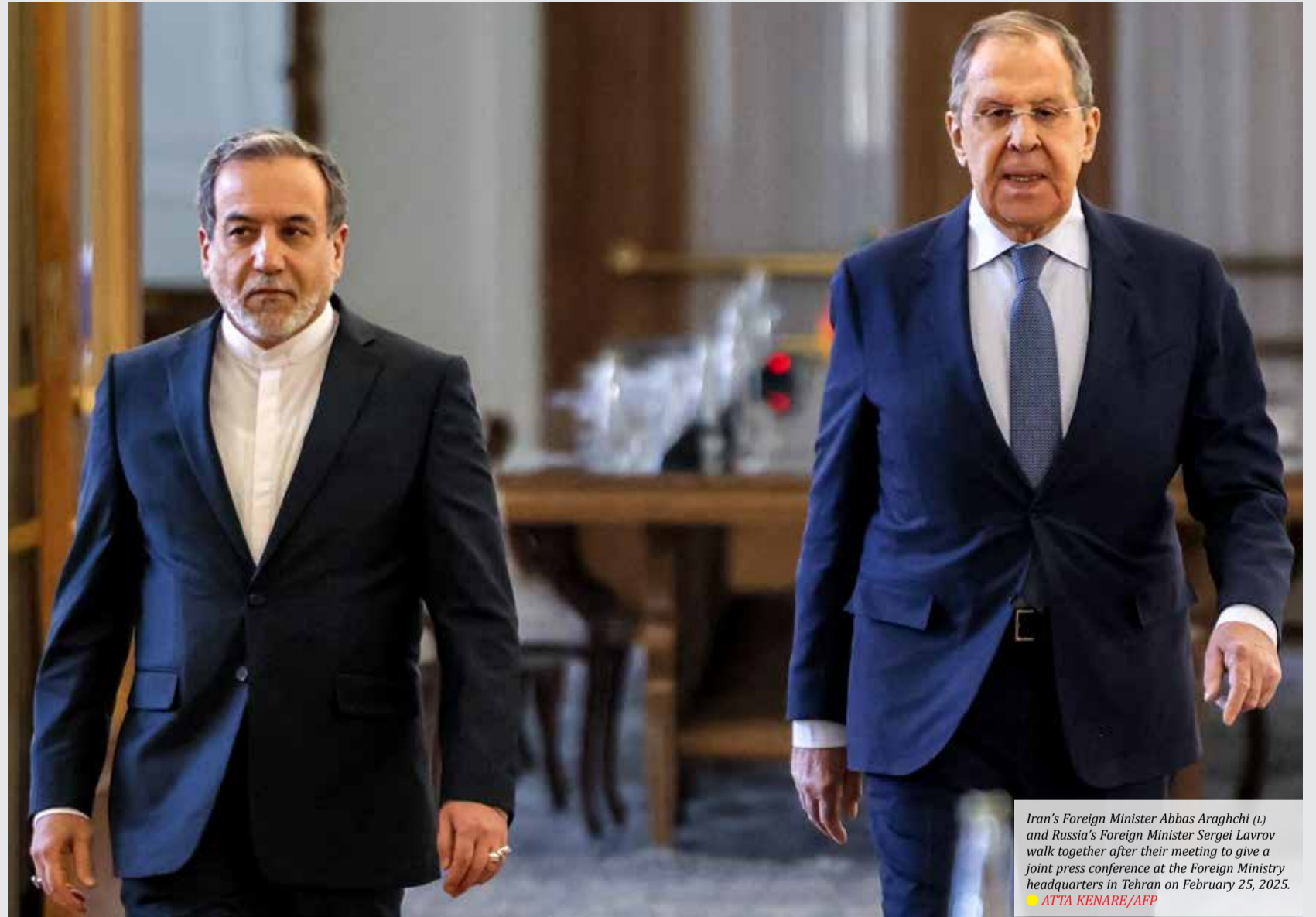
Iran's Foreign Minister Abbas Araghchi (L) and Russia's Foreign Minister Sergei Lavrov walk together after their meeting to give a joint press conference at the Foreign Ministry headquarters in Tehran on February 25, 2025.