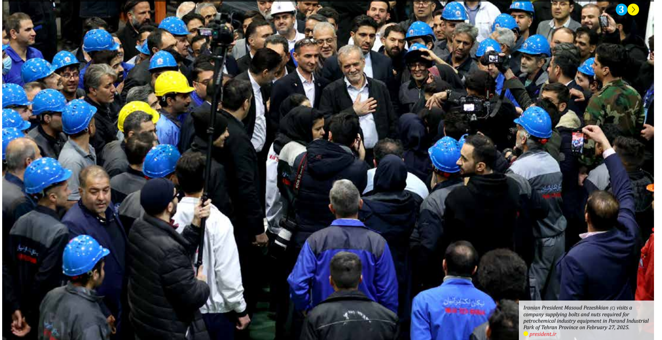
Iranian President Masoud Pezeshkian (c) visits a company supplying bolts and nuts required for petrochemical industry equipment in Parand Industrial Park of Tehran Province on February 27, 2025.