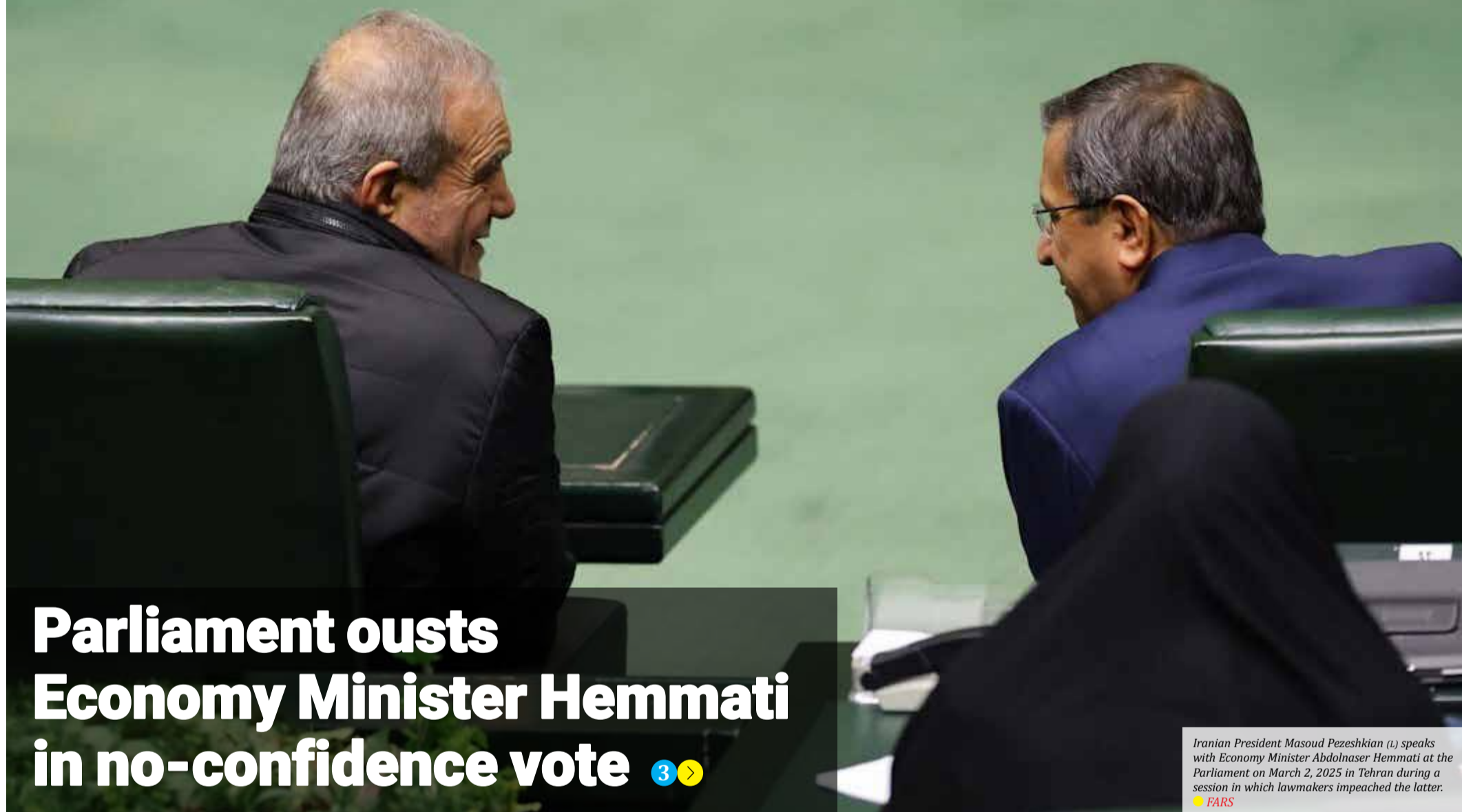
Iranian President Masoud Pezeshkian (L) speaks with Economy Minister Abdolnaser Hemmati at the Parliament on March 2, 2025 in Tehran during a session in which lawmakers impeached the latter.