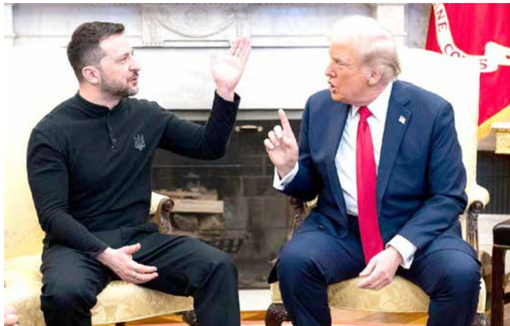
US President Donald Trump (R) and Ukrainian President Volodymyr Zelenskyy have a confrontational meeting in the Oval Office of the White House on February 28, 2025

phone call with senior officials in the Trump administration. This media outlet claims that the US threat to cut military and financial aid if Ukraine did not cooperate played a crucial role in changing Kyiv's stance. Politico also reported that Zelenskyy received assurances for continued limited support during a meeting with US congressional representatives in Washington, conditioned on Ukraine accepting a cease-fire. Political observers contend that US economic and military pressure has put Zelenskyy in a position with limited options. The reduction of European sup-