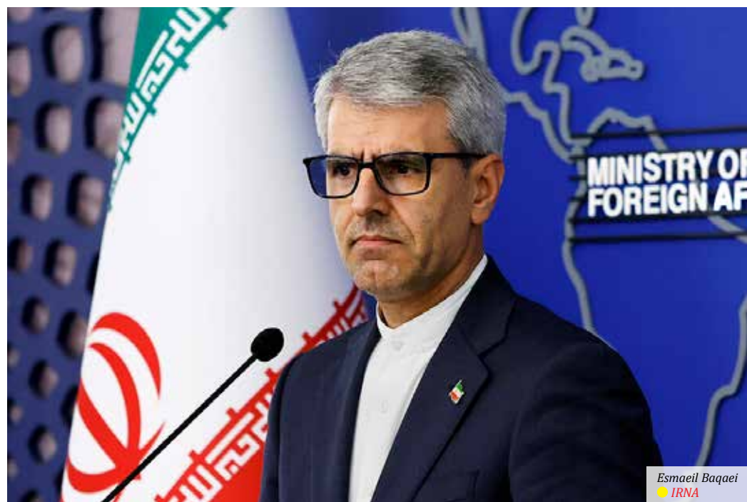
Esmail Baqaei

States in January. However, Trump's language of threats and imposition of sanctions against Iran have made Iranian officials skeptical of negotiations with the US. Iranian officials say that negotiations under pressure are not meaningful. In response to a question about any discussion about Iran's nuclear issue between Russian and US presidents during their recent talks, Baqaei said that, "There may have been some discussion between the US and Russia regarding the Iranian nuclear issue as one of the international issues." He also responded to a question about whether the Russian foreign minister had raised the idea of mediation during his recent visit to Tehran, saying that, "I have already said that regarding these issues, given their importance, some parties may express their