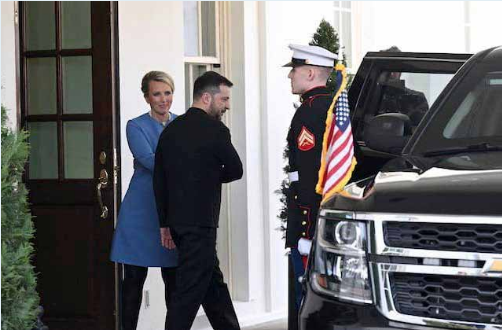
Ukraine's President Volodymyr Zelenskyy (c) leaves the White House after meeting with US President Donald Trump (not seen in this picture) in Washington, D.C., on February 28, 2025.

This dispute not only revealed NATO’s internal challenges but also highlighted horizontal and vertical rifts within the Western alliance. If Trump halts military aid to Ukraine and eases sanctions against Russia, the European Union will face its biggest