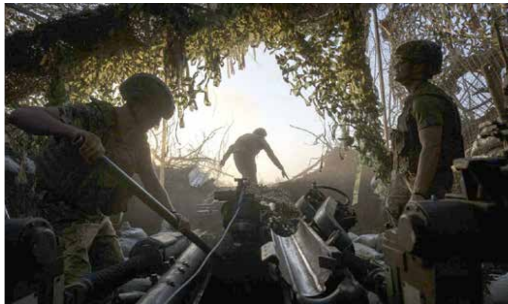
Ukrainian servicemen of 148th separate artillery brigade of the Air Assault Forces prepare a M777 howitzer to fire towards Russian positions at the frontline in Donetsk region on August 21, 2024