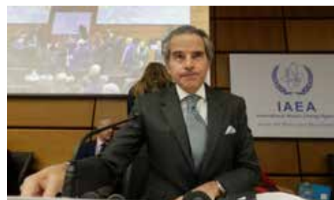
Director General of the International Atomic Energy Agency (IAEA) Rafael Grossi reacts prior to the start of the quarterly Board of Governors meeting at the agency's headquarters in Vienna, Austria, on March 3, 2025.

While Trump said last month he's open to a