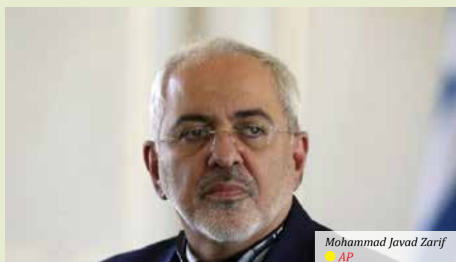
Mohammad Javad Zarif

In a Monday post on X, Zarif said he had "faced the most horrible insults, slander and threats against myself and my family, and I have gone through the most bitter period of my 40 years of service." He added, "To avoid further pressure on the government, the head of the Judiciary recommended that I resign and... I accepted immediately." Since he was tapped as vice-president, Zarif has been taking intense heat by a group of ultra-conservative lawmakers in Parliament who have argued that his appointment to a