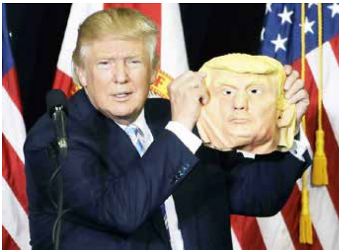
During a campaign speech, Donald Trump holds up a mask of his face in Sarasota, Florida, on November 7, 2016.

The article first appeared in Persian on Quds Online.