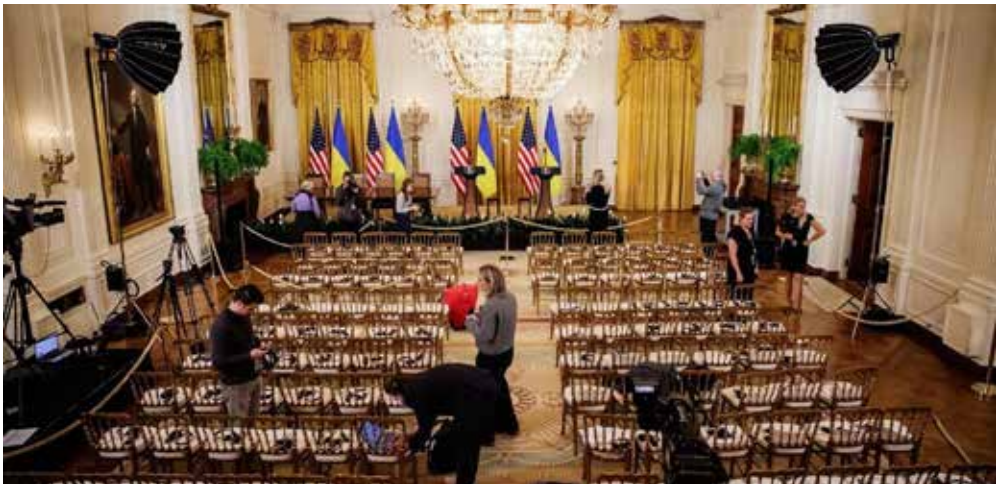
Staffers of the White House await the start of a joint press conference by the US and Ukraine presidents, which was later canceled as Donald Trump kicked out his Ukrainian counterpart following a heated meeting on February 28, 2025.

OPINION When it comes to diplomatic meetings between heads of state, it is customary for even the smallest details of the ceremony to be meticulously planned and purposeful — from the attire and handshakes of the officials to even their manner of speaking and laughter. However, Donald Trump, much like how his return to the White House has profoundly transformed and redirected the course of US politics, seems to have many surprises up his sleeve when it comes to the etiquette of dialogue. This was evident in the bizarre and unusual events that unfolded during the Saturday evening meeting between the leaders of the United States and Ukraine. For Trump, Zelenskyy, the European Union, and even Russia, as well as the people who expected a routine diplomatic meeting, everything took an unexpected turn.