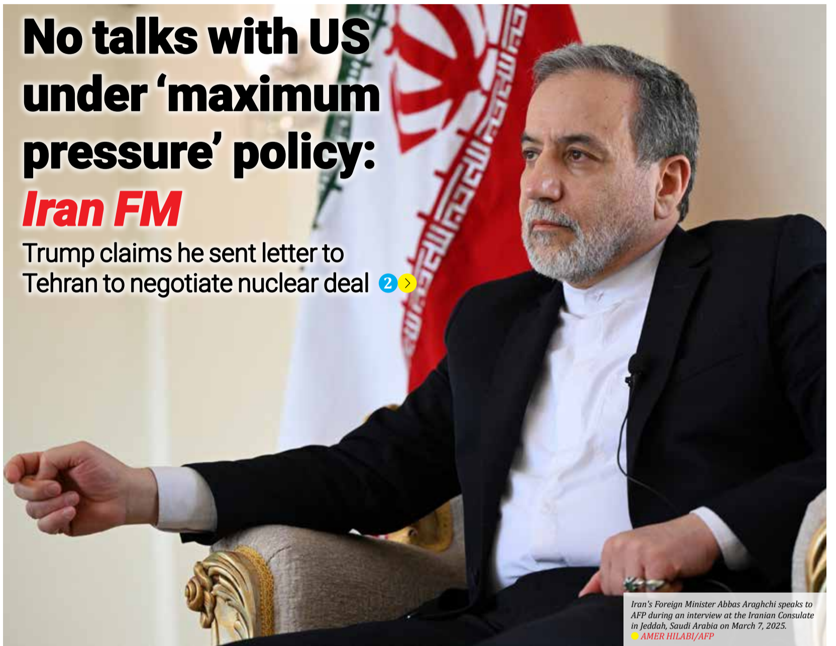
Iran's Foreign Minister Abbas Araghchi speaks to AFP during an interview at the Iranian Consulate in Jeddah, Saudi Arabia on March 7, 2025.

Trump claims he sent letter to Tehran to negotiate nuclear deal 2 >