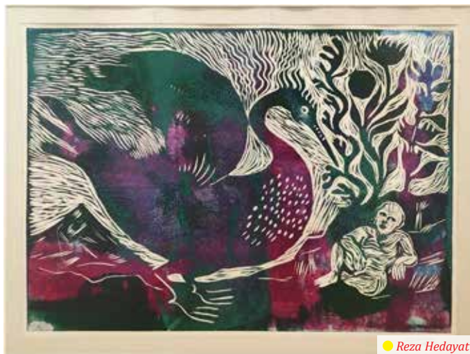
● Reza Hedayat