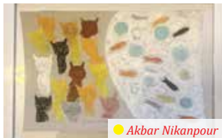
● Akbar Nikanpour