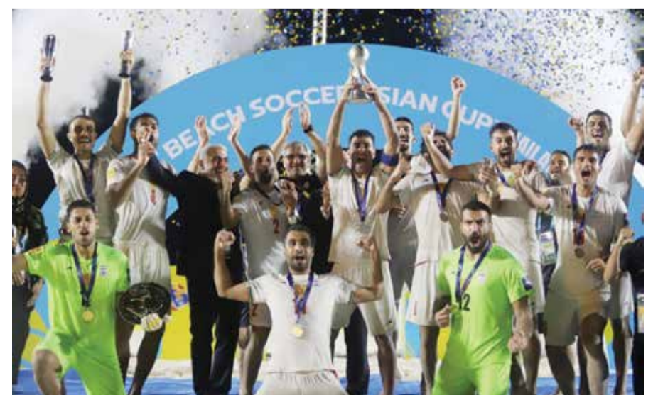
Iranian players celebrate lifting the AFC Beach Soccer Asian Cup trophy after an 8-1 win against Oman in the final in Pattaya, Thailand, on March 30, 2025.

joyed thrilling campaigns to leave Amman with a gold medal.