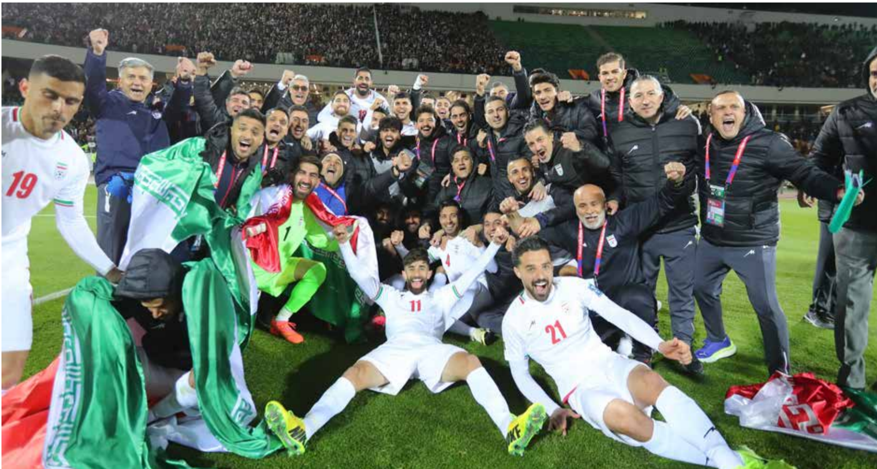
Iranian players and coaching staff celebrate qualification for the 2026 World Cup after a 2-2 draw against Uzbekistan at the Azadi Stadium, Tehran, Iran, on March 25, 2025.