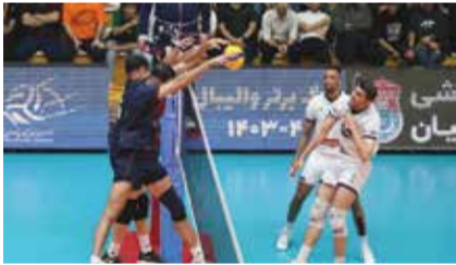
Iranian Volleyball Premier League Finals:

Tensions between Tehran and Washington are heating up as indirect negotiations hang in the balance. Trump's recent comments throw a wrench in the works, suggesting a shift toward bilateral talks. Amid mixed messages from US officials, some experts argue that the deployment of bombers is a show of force rather than a prelude to conflict. The "carrot and stick" tactic may backfire, as Iran stands firm against pressure. With concerns mounting over a potential military confrontation, analysts weigh in on the future of these fraught relations, hinting that the outcome of any talks could tip the scales toward peace or escalation. See pages 4-5 >