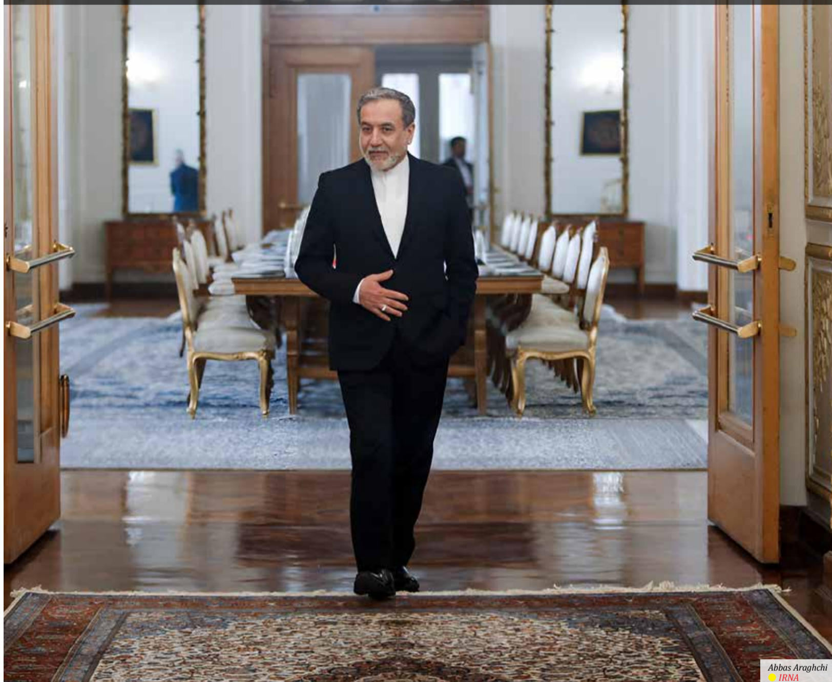
Abbas Araghchi IRNA