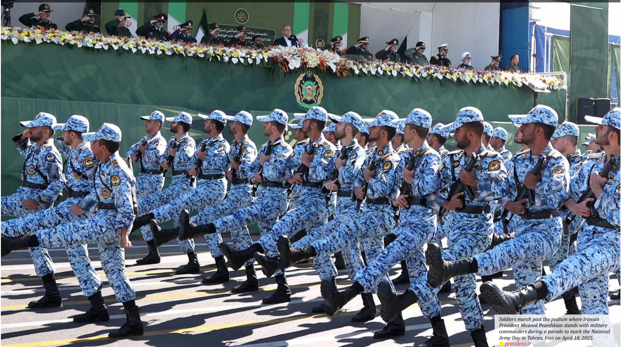
Soldiers march past the podium where Iranian President Masoud Pezeshkian stands with military commanders during a parade to mark the National Army Day in Tehran, Iran on April 18, 2025.