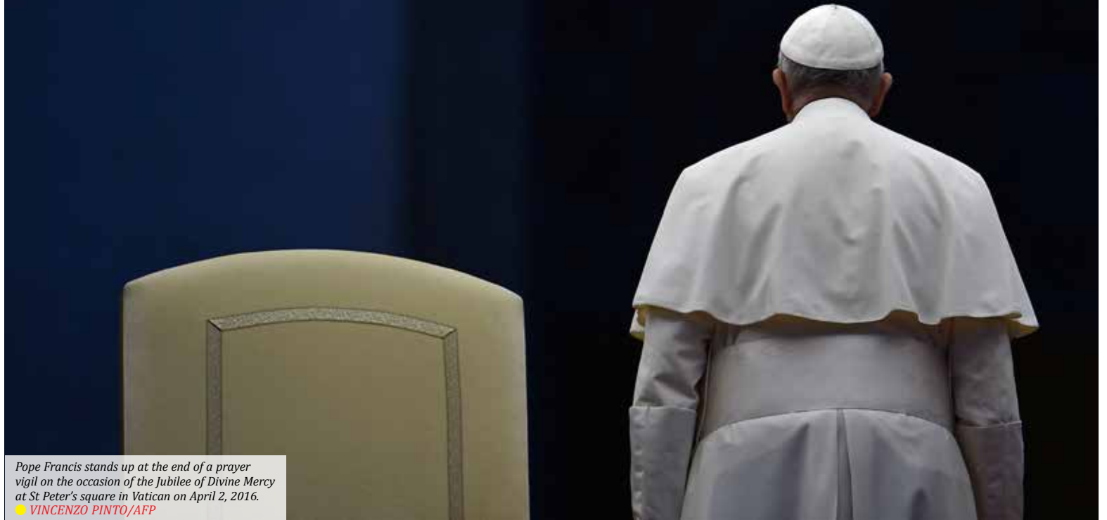
Pope Francis stands up at the end of a prayer vigil on the occasion of the Jubilee of Divine Mercy at St Peter's square in Vatican on April 2, 2016.

Pezeshkian: Pope Francis will remain in hearts of all awakened consciences and freedom-seekers 2 >