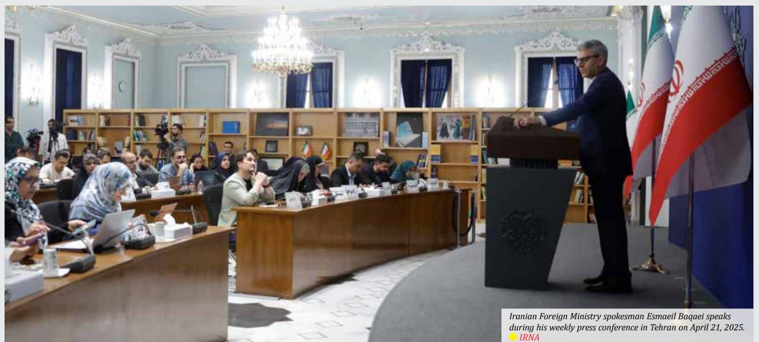
Iranian Foreign Ministry spokesman Esmail Baqaei speaks during his weekly press conference in Tehran on April 21, 2025.