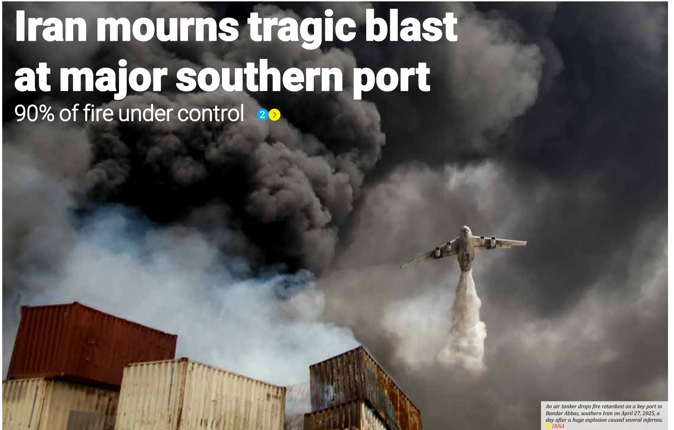
An air tanker drops fire retardant on a key port in Bandar Abbas, southern Iran on April 27, 2025, a day after a huge explosion caused several infernos.