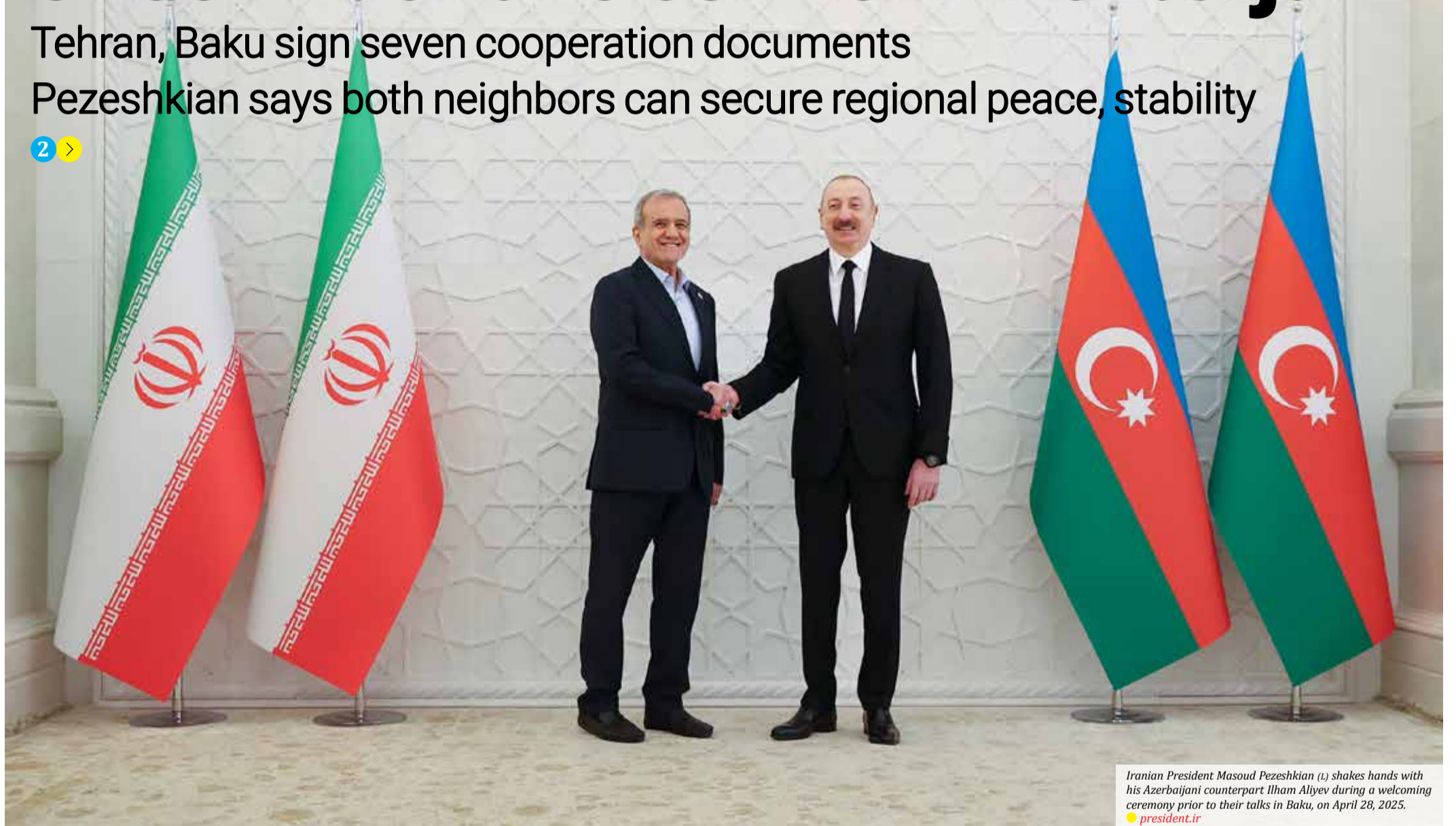
Iranian President Masoud Pezeshkian (L) shakes hands with his Azerbaijani counterpart Ilham Aliyev during a welcoming ceremony prior to their talks in Baku, on April 28, 2025.