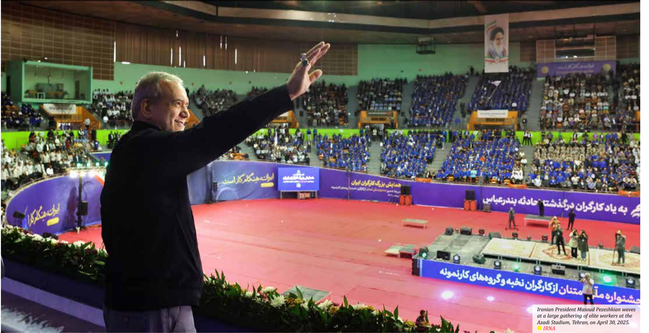
Iranian President Masoud Pezeshkian waves at a large gathering of elite workers at the Azadi Stadium, Tehran, on April 30, 2025.