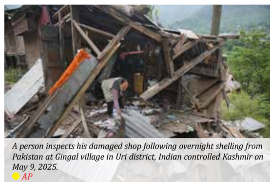
A person inspects his damaged shop following overnight shelling from Pakistan at Gingal village in Uri district, Indian controlled Kashmir on May 9, 2025.