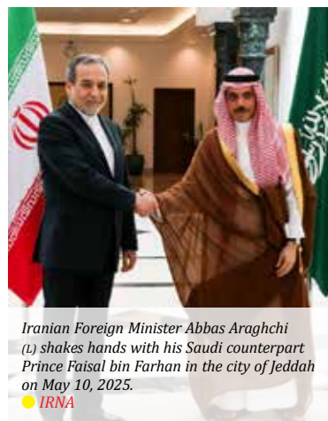
Iranian Foreign Minister Abbas Araghchi (L) shakes hands with his Saudi counterpart Prince Faisal bin Farhan in the city of Jeddah on May 10, 2025.

Iran's current foreign policy is hardly a breaking new ground, rather it rests on two main pillars of indirect talks with the United States and beefing up ties with neighboring countries—an agenda that President Masoud Pezeshkian has flagged as a top priority. The first three rounds of Iran-US negotiations got off to a careful and measured start, with both sides laying out the framework, protocols, and main talking points. But, as expected, as the talks moved into the nitty-gritty, complications and specific requirements have come to the fore. One such requirement is the need to keep in the loop those countries enjoying good or improving relations with Iran, especially where multiple agreements are on the table.