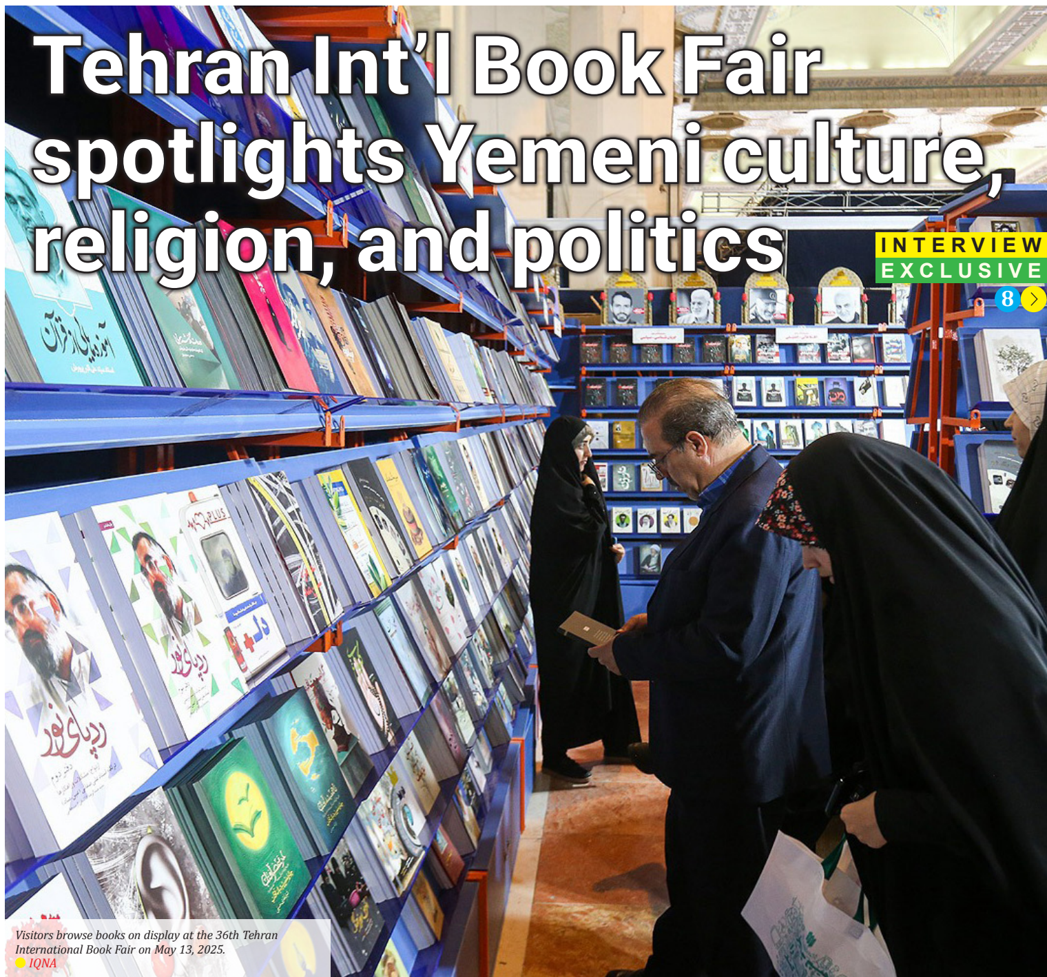
Visitors browse books on display at the 36th Tehran International Book Fair on May 13, 2025.