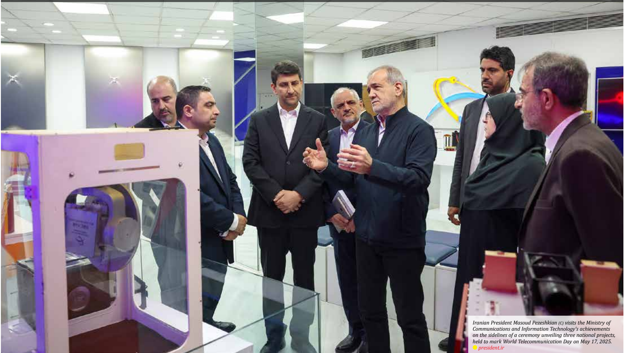
Iranian President Masoud Pezeshkian (C) visits the Ministry of Communications and Information Technology's achievements on the sidelines of a ceremony unveiling three national projects, held to mark World Telecommunication Day on May 17, 2025.

Minister: Major space industry projects to be completed by yearend 3 >