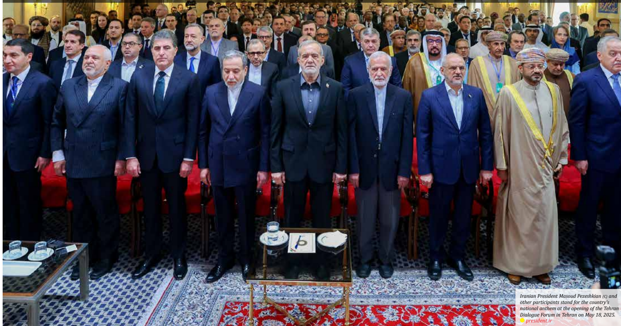
Iranian President Masoud Pezeshkian (c) and other participants stand for the country's national anthem at the opening of the Tehran Dialogue Forum in Tehran on May 18, 2025.